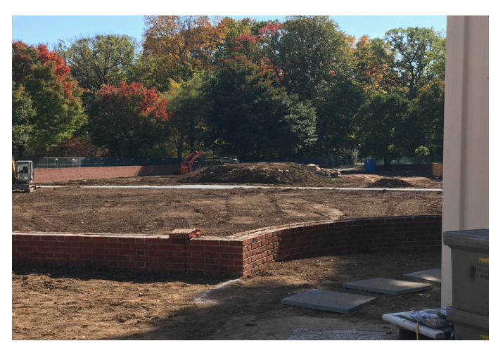
The dirt rally course construction site, at the former site of the 'Bowl.'

THIS past Saturday, Lawrenceville Building and Grounds Staff finished their installation of landmines in the Crescent Green, their final effort to curb the Green's use as a shortcut. With the typical Lawrentian flair, students have now dubbed the Green the "Hellville DMZ."